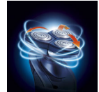
Flex & Pivot Action